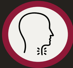
Sore throat or trouble swallowing