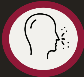
Loss of taste or smell