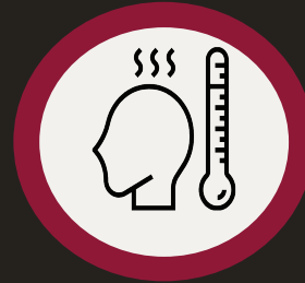
Fever or chills