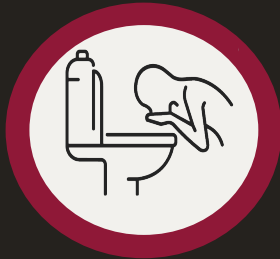
Nausea, vomiting, diarrhea